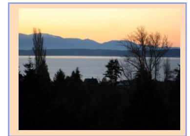
North Shore, Seattle, Washington

--I returned to Seattle, Washington, just before Thanksgiving, 2010, to begin what turned out to be a year of unemployment and secondary homelessness, a rather harrowing experience, albeit blessed with time for volunteering, visiting friends and house-sitting in scenic settings. Living out of a suitcase and having no place of my own got old—but I got to share the lives and homes of kind and fascinating people.