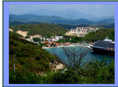
Bahía Santa Cruz, Huatulco, México

--During July and part of August, I visited supporting churches, attended conferences and visited family in Orlando, Florida