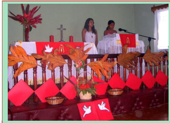
"Our best, most fruitful workshop ever:" the result of lots of joint ICLH/Minnesota planning and work.

the national Theological-Liturgical Training held near La Ceiba for leaders of worshipping communities, with the support of our Minnesota Partners team. The training featured in-depth study of the Bible passages for Pentecost and hands-on practical workshops. Back in Tegus there was a Homiletics Workshop for pastors and preachers.