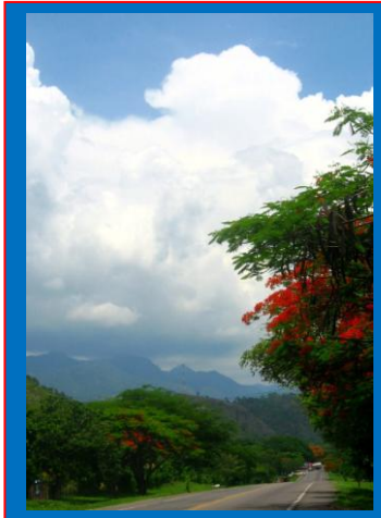
Scarlet Acacias bloom in late dry season, contrasting with wet season's green (above)

The rains of May The eagerly-awaited "winter" (what the Wet Season is called—even though the temperature is hot and now also humid) rains began to show up a bit early. Only three weeks of occasional rain have encouraged the sere, blackened land to show the beginnings of Irish-green lushness.