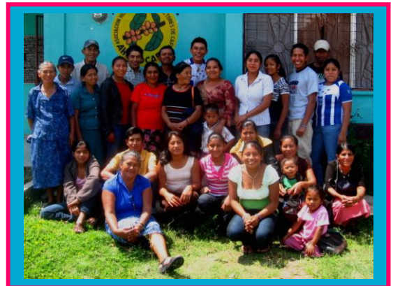
SEFCA workshop in Marcala, in SW Honduras